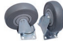
Part# eCARTWHLF "S"