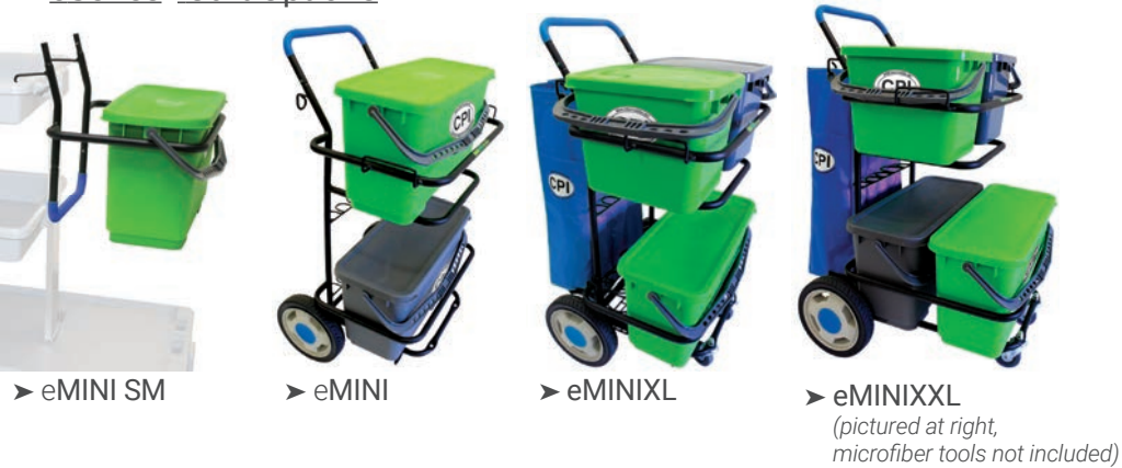
➤ eMINI SM