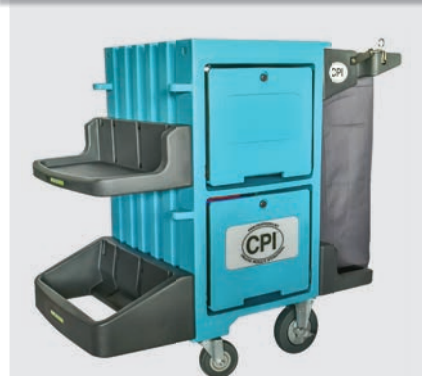
Part# eCART 2