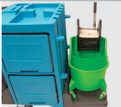
Part# eCART 2 DUO