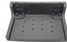
Part# eCARTDUO "U"