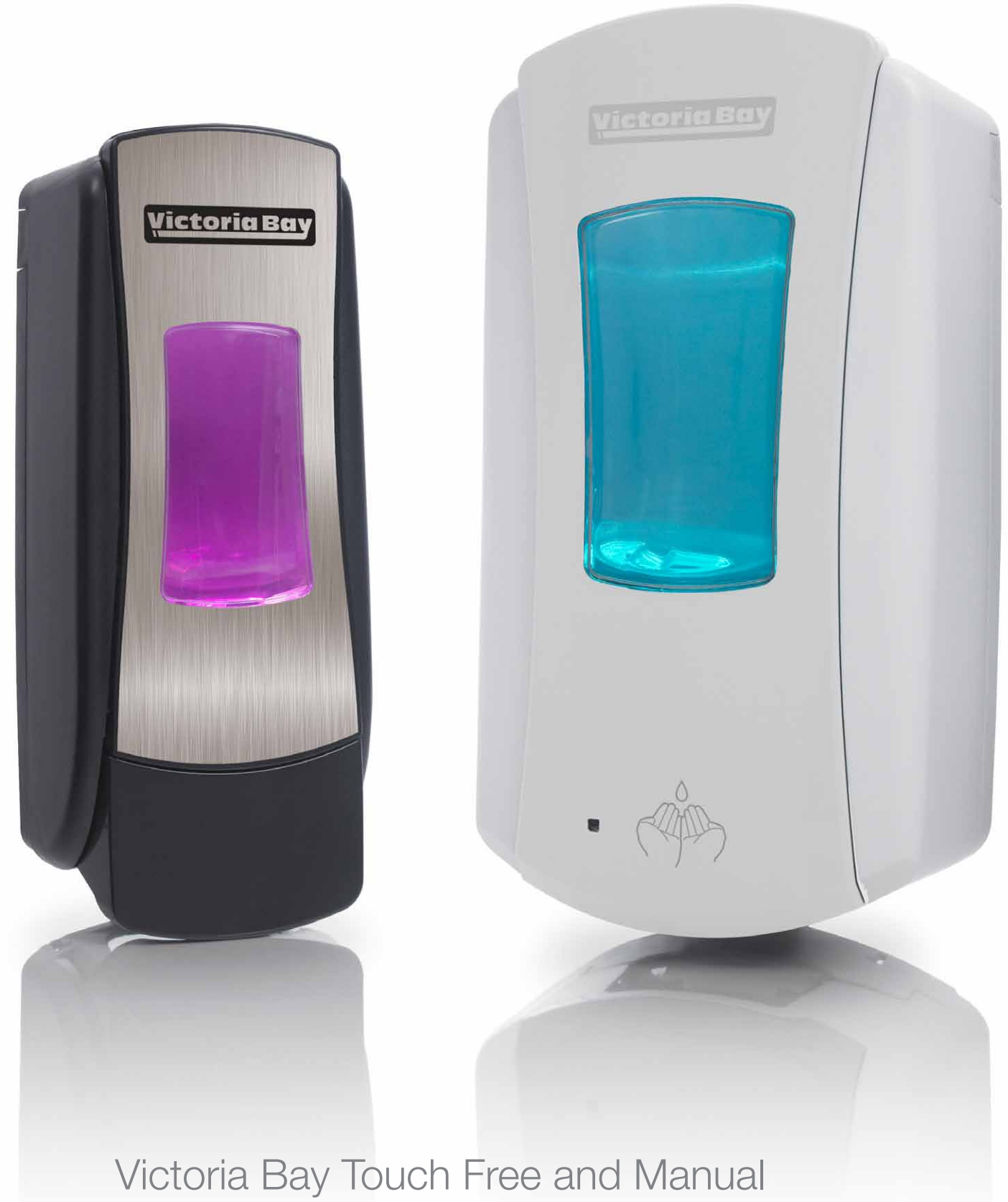
Victoria Bay Touch Free and Manual Foam Skincare Dispensing Systems

©2011, GOJO Industries, Inc. All rights reserved. • UT-ADXLTX-HBC (12/2011) • The following trademarks belong to GOJO Industries, Inc. - PURELL®, SANITARY SEALED™, SMART-FLEX™, TRUE FIT™, MESSENGER™, SHIELD™.