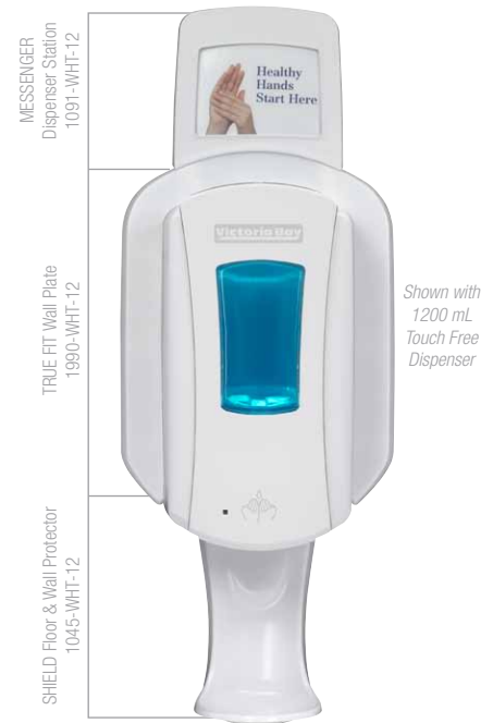
Shown with 1200 mL Touch Free Dispenser