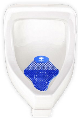
Fold Lines for Compact Urinals