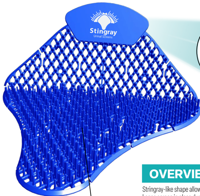
Tear-Out to Accommodate the Drain Dome Covers