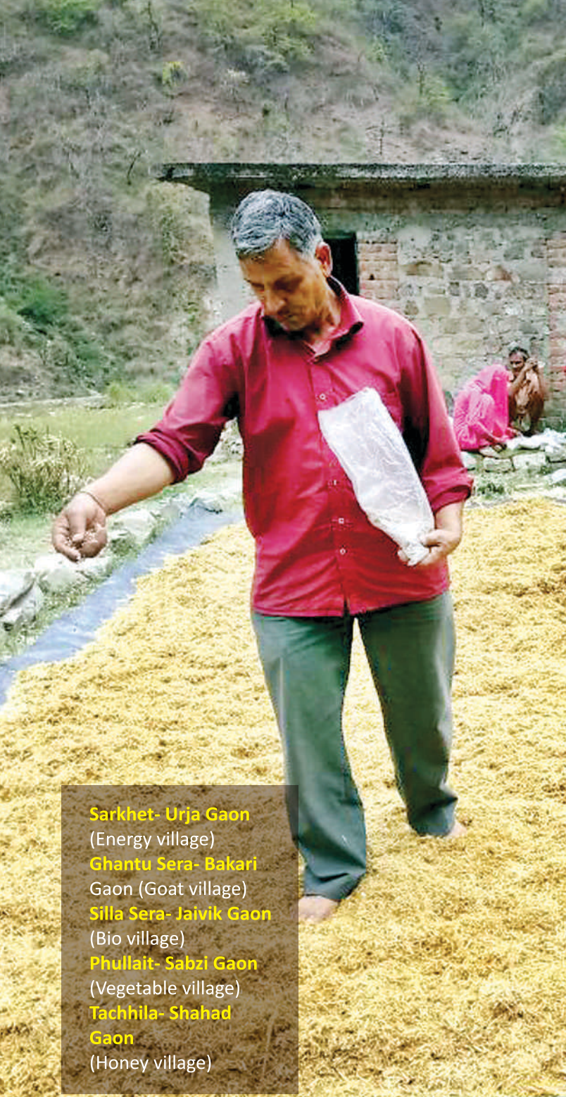
Sarkhet- Urja Gaon (Energy village) Ghantu Sera- Bakari Gaon (Goat village) Silla Sera- Jaivik Gaon (Bio village) Phullait- Sabzi Gaon (Vegetable village) Tachhila- Shahad Gaon (Honey village)

AUF has been running a one of its kind Computer centre in GGIC, Phullait village. Apart from this, started a Library for students of all ages, to have access to finest books including Encyclopedias, Philosophical and Story books, Autobiographies, poetry and course books, Comics and Reference material.