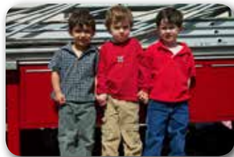
Gan HaYeled students thoroughly enjoyed last year's Truck Day!

Beep! Beep! Honk! Honk! The 21st annual Gan HaYeled Truck Day is Wednesday, May 8, 9:00 am–noon, in our parking lot. The children get to climb in, on, and around all sorts of vehicles, from snow plows and dump trucks to fire trucks and motorcycles. The synagogue parking lot will be closed during that time; we apologize for any inconvenience.