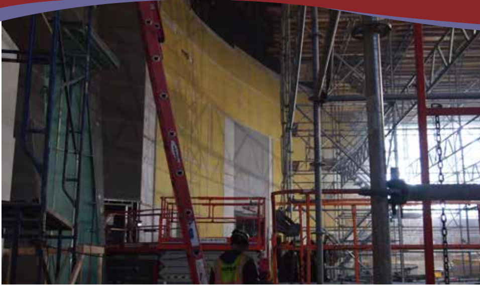
The Charles E. Smith Sanctuary—still a work in progress.

Keeping Up with the Vision is a monthly column providing up-to-the-minute information about our exciting renovation process. This is where you can find all you need to know to access all of our programs and activities during the construction phases. You can also follow all the noteworthy developments as they unfold over the coming year. Keep up with the progress as we strengthen Adas's ability to meet the social, intellectual, and religious needs of our wonderful congregation.