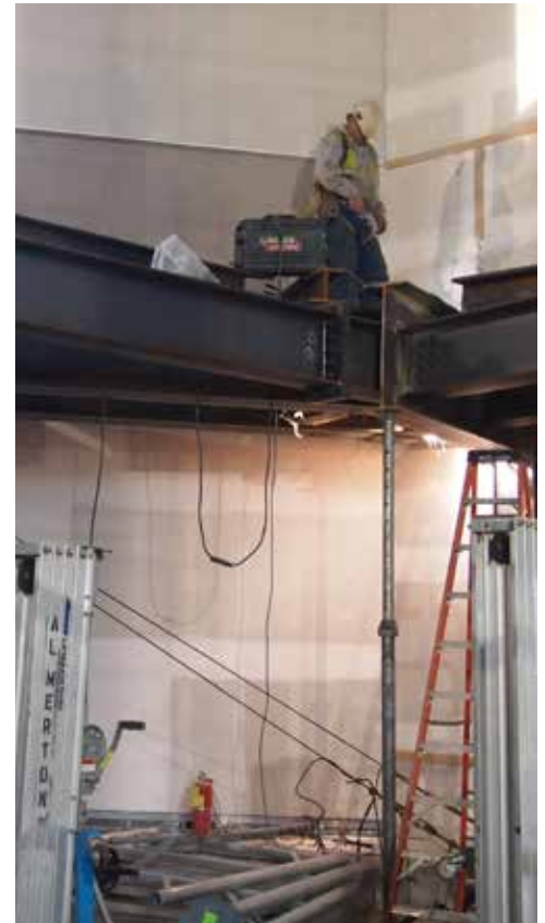
A Forrester Construction worker evaluates his progress on expanding the balcony level all the way to the front of the Charles E. Smith Sanctuary.

One of the keystones of Phase III: construction of the new Beit Midrash, home of Makom DC.