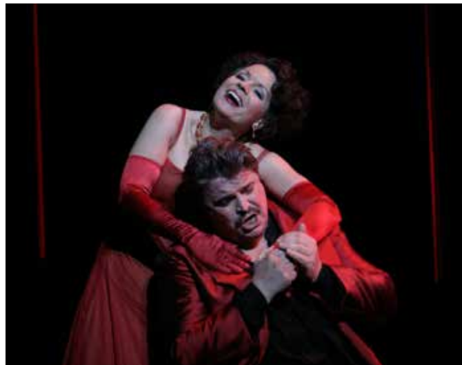
A scene from one of Theodor Herzl's favorite operas— Tannhäuser .