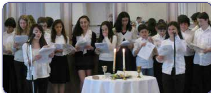
Sixth graders lead the Model Seder with their rendition of the Four Questions.

Fifth graders visit Sunrise Assisted Living residents as part of the students' unit on Hiddur P'nei Zaken/Respecting the Elderly. They sang and played music for the appreciative residents.