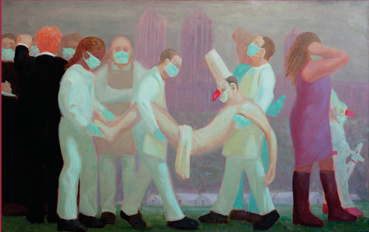
The Covid Paintings