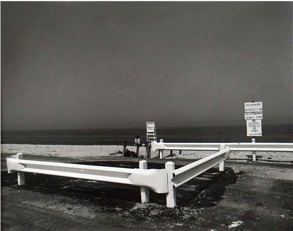
The Last Picture

In the context of the North Fork of Long Island, expanded his vision to nature; both brutal and peaceful. His final photograph was of the sea meeting the sky.