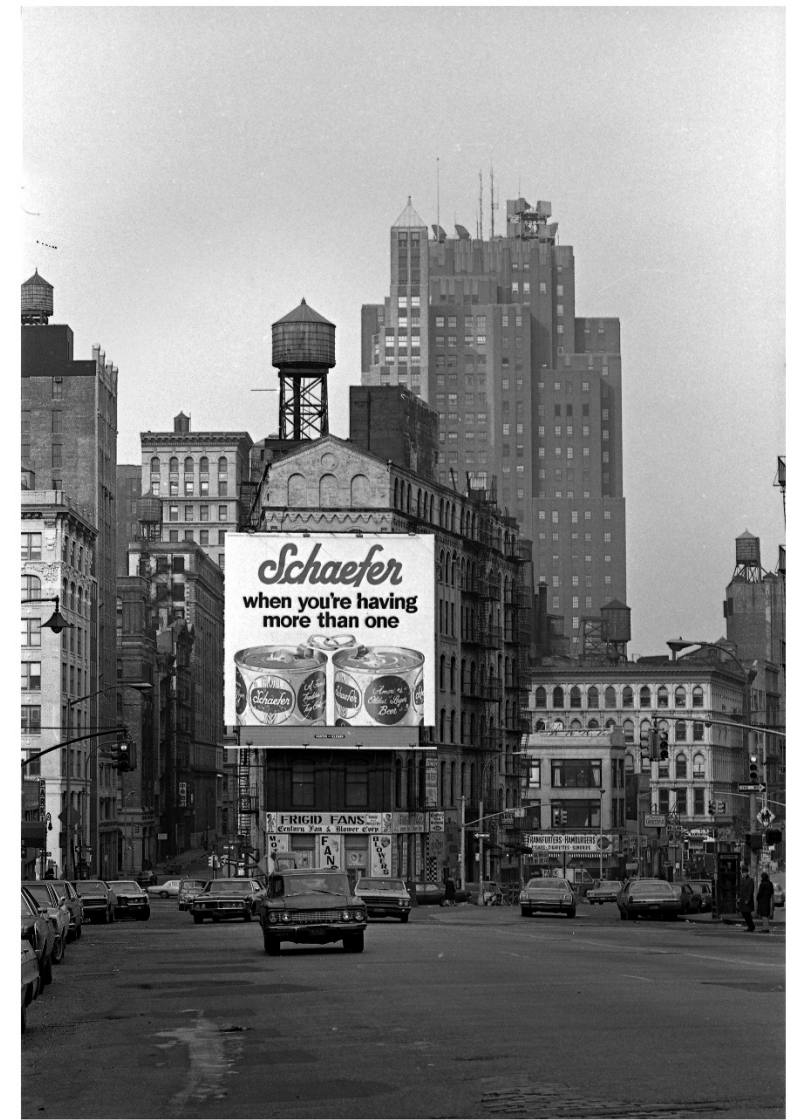
1972, Canal Street

He traveled to Costa Rica and Mexico, as well, revealing a deep affinity for all people of the world.