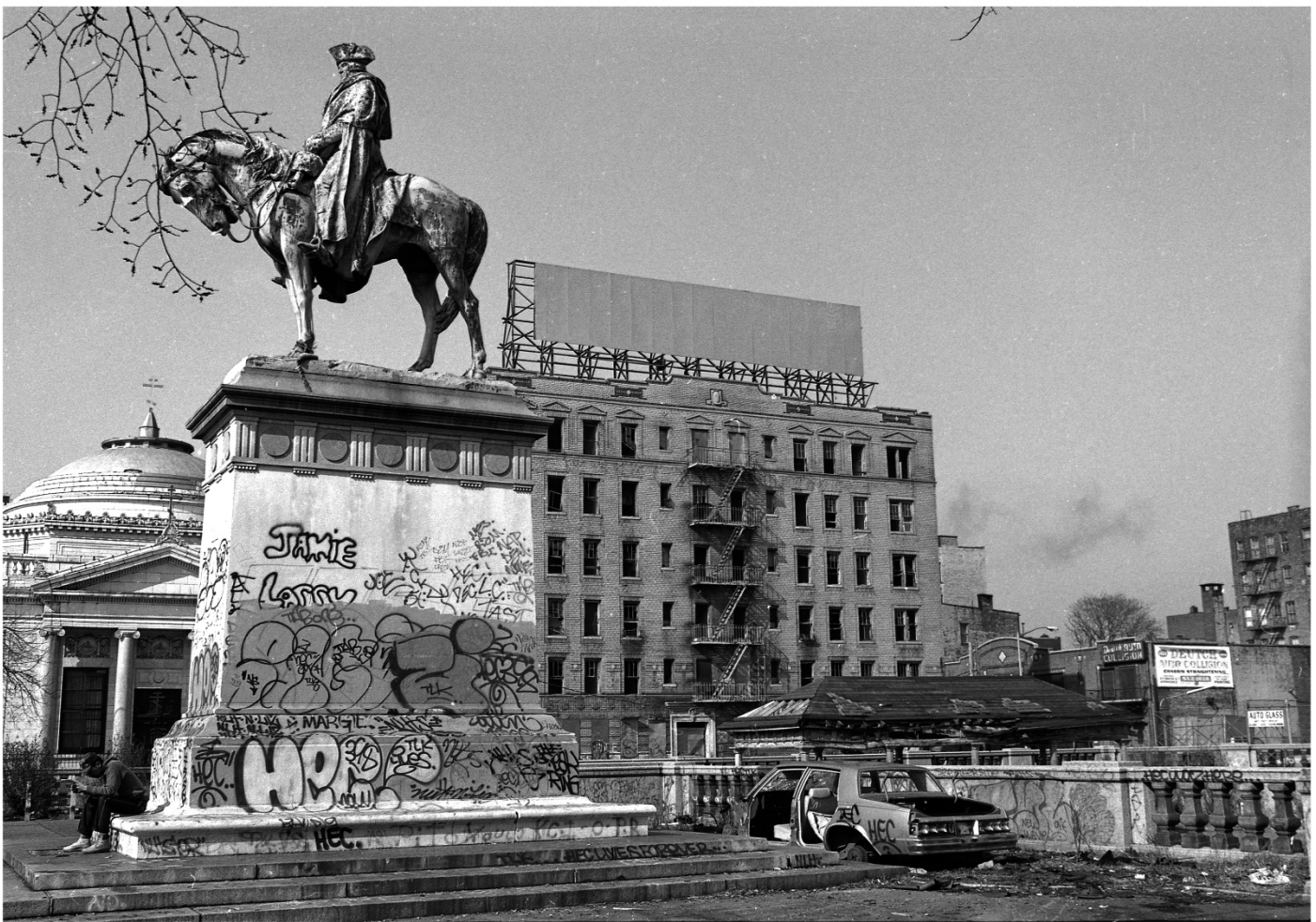
Continental Army Plaza, Roebling Street, Brooklyn NY 1984