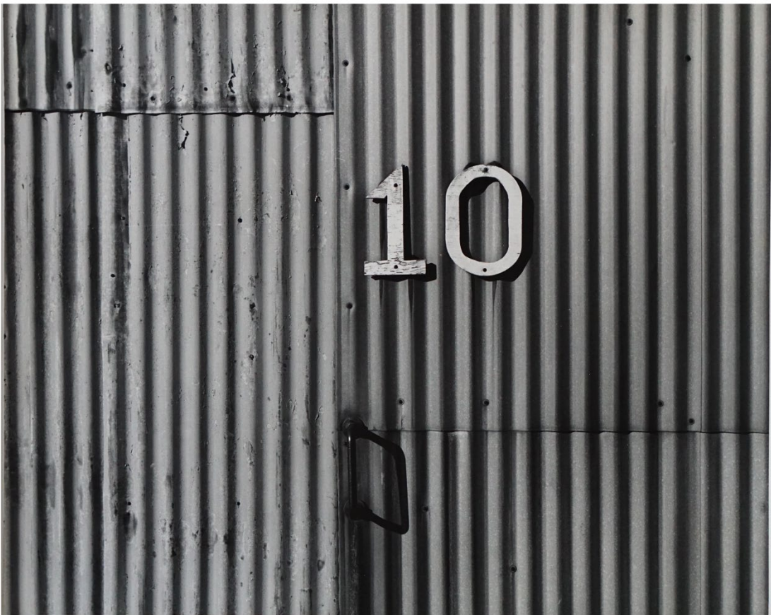
North Fork, Long Island

Later in life, his directive was in minimal landscapes, and of his beloved Long Island Sound.