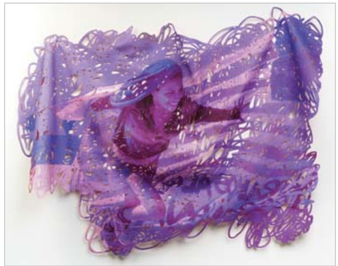
La Prensa 5 (purple), 2019.

Did she worry that it would appear she was trying to profit from others' misfortune? "I had my own thoughts about that," she admits. "What I decided to do was to send a certain percentage of what I was making to the International