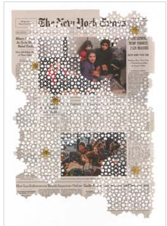
2.21.18, 2018. Courtesy of Rick Wester Fine Art