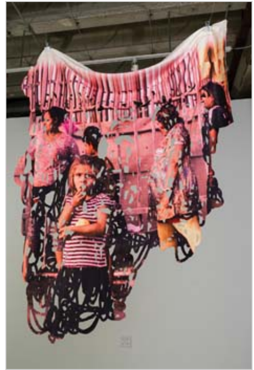
Untitled (caravana1), 2019.