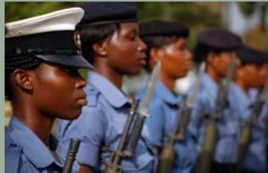
Building Strong NCO Corps: NCO Professional Development