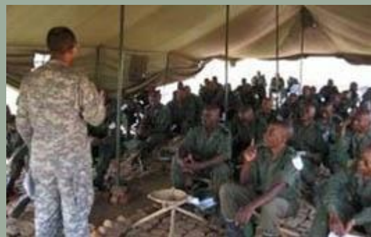
Building Institutions: Inspector General, Legal, Chaplaincy, and others