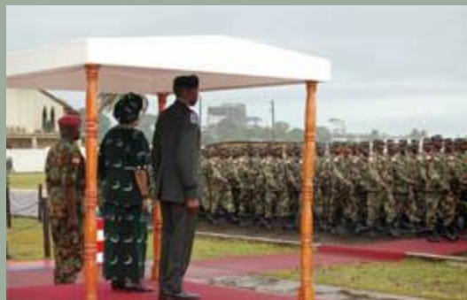
Conducting Defense Sector Reform (DSR): Liberia