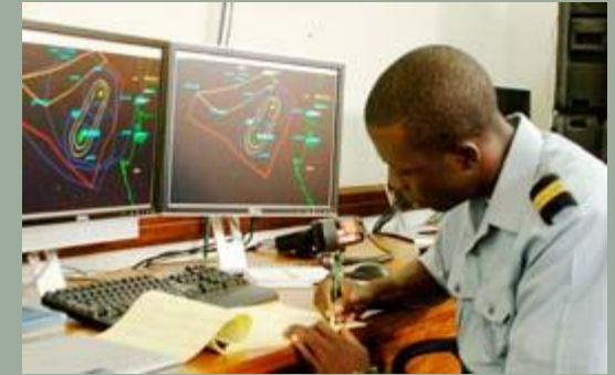
Improving Control of the Seas: Maritime Domain Awareness