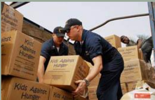
Lending a Hand: Support to Project HANDCLASP and other Humanitarian Assistance Efforts