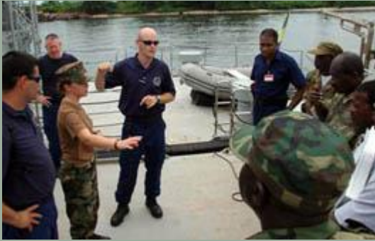
Growing Maritime Security Capacity: Africa Partnership Station (APS)