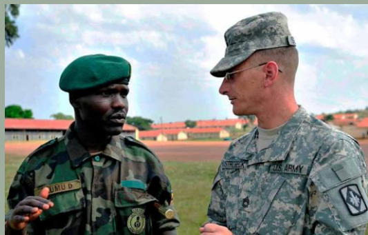
Developing Lasting Relationships: State Partnership Program (SPP)