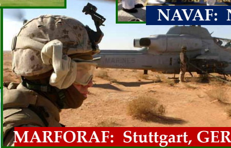
MARFORAF: Stuttgart, GER