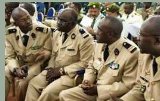
Promoting Interoperability: AFRICA ENDEAVOR