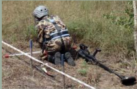
Rendering Former Battlefields Safe for Use: Humanitarian Mine Awareness