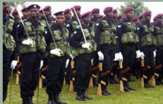
Training and Professionalizing: Democratic Republic of Congo Light Infantry Battalion