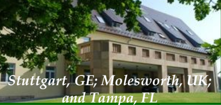
Stuttgart, GE; Molesworth, UK; and Tampa, FL