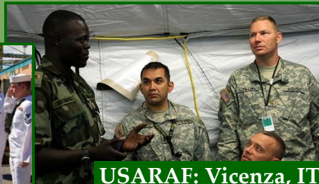
USARAF: Vicenza, IT