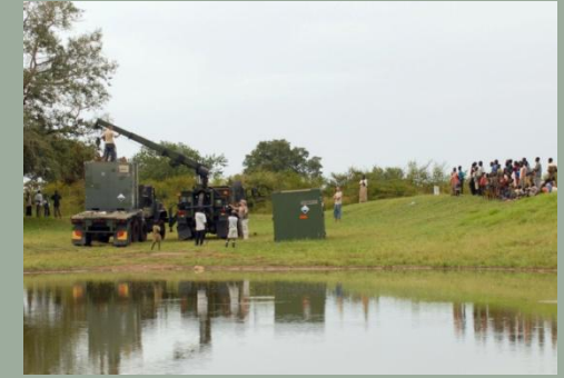
Increasing Regional Response Capacity: NATURAL FIRE