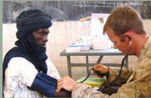
Spreading Goodwill: Medical/ Veterinary Civil Action Programs (MEDCAP/VETCAP)