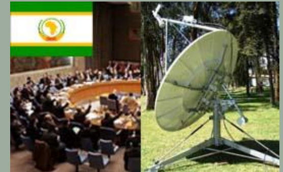
Constructing a Network: Comms for AU Peace and Security Commission