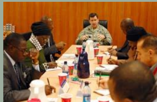
Reaching Out: Through International Media, Private Enterprise, Non-Government Orgs, etc.