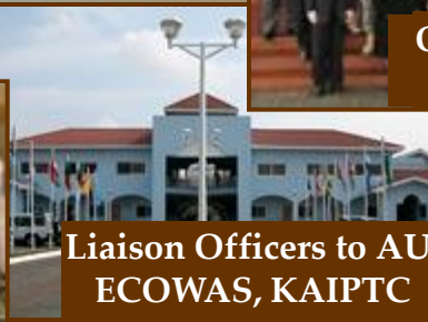
Liaison Officers to AU, ECOWAS, KA IPTC