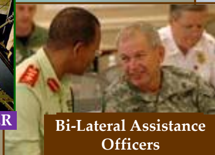
Bi-Lateral Assistance Officers