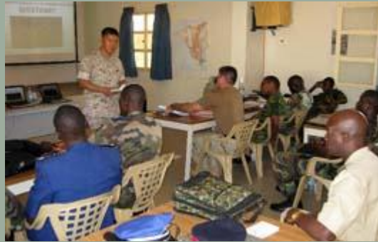
Military Intelligence (MI) Education: MI Basic Officer Course-Africa