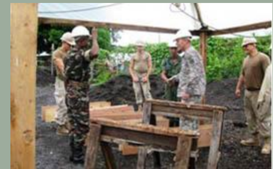
Helping Build Infrastructure: Exercise Related Construction (ERC)