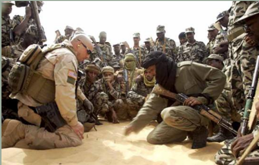
Supporting Partner Counter Terrorism Efforts: OEF-Trans Sahara