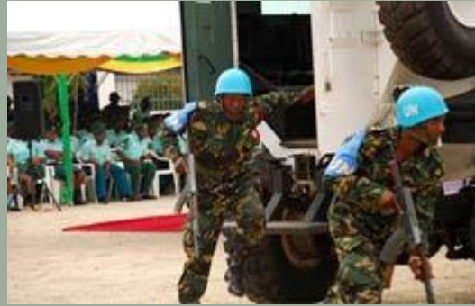
Training Peacekeepers: Africa Contingency Operations Training and Assistance (ACOTA)