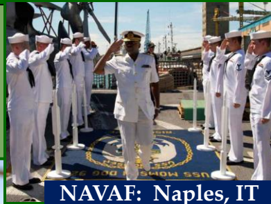
NAVAF: Naples, IT