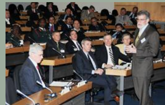
Engaging in Dialogue: Academic Symposia and Other Partnership Forums