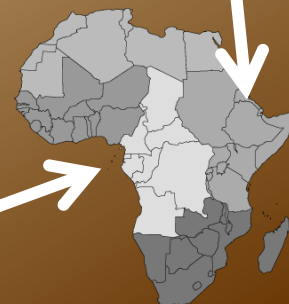
At U.S. Embassies