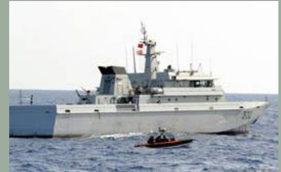
Helping Secure Territorial Waters: Africa Maritime Law Enforcement Program (AMLEP)