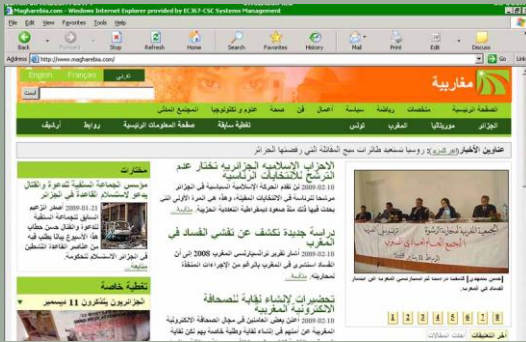
Countering Violent Extremist Ideologies: OBJECTIVE VOICE