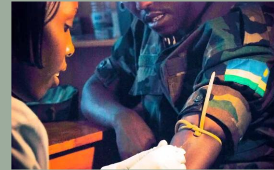
Preserving Readiness: Defense HIV/AIDS Prevention Program (DHAPP)