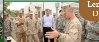
Camp Lemonnier, Djibouti