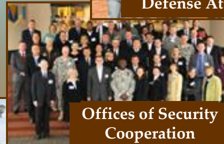
Offices of Security Cooperation