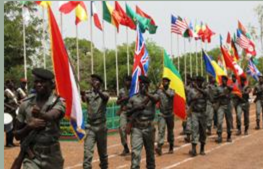
Building Regional Partnerships: FLINTLOCK