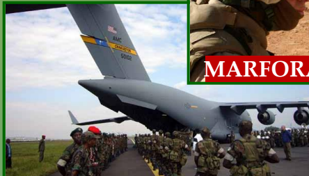
AFAFRICA: Ramstein, GER