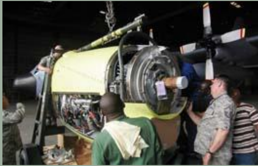
Building Sustainment Capability: Adaptive Logistics Network