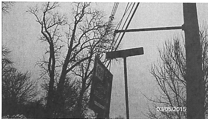
Subject - Additional Street