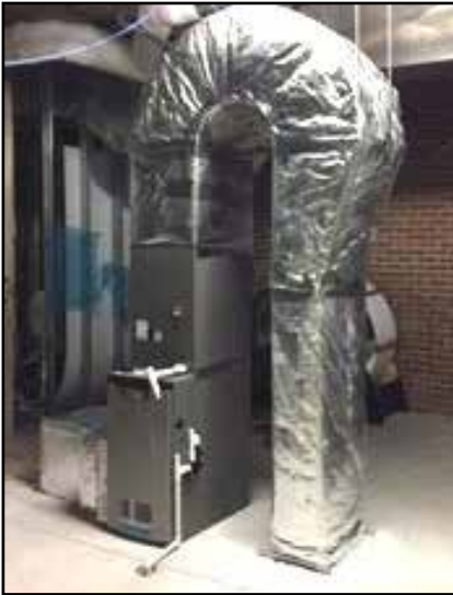
Kitchen furnace has been installed on second floor.

The most expensive part of the kitchen (HVAC) has been completed as far as it can go for now. HVAC work will be completed when the ceiling goes up.