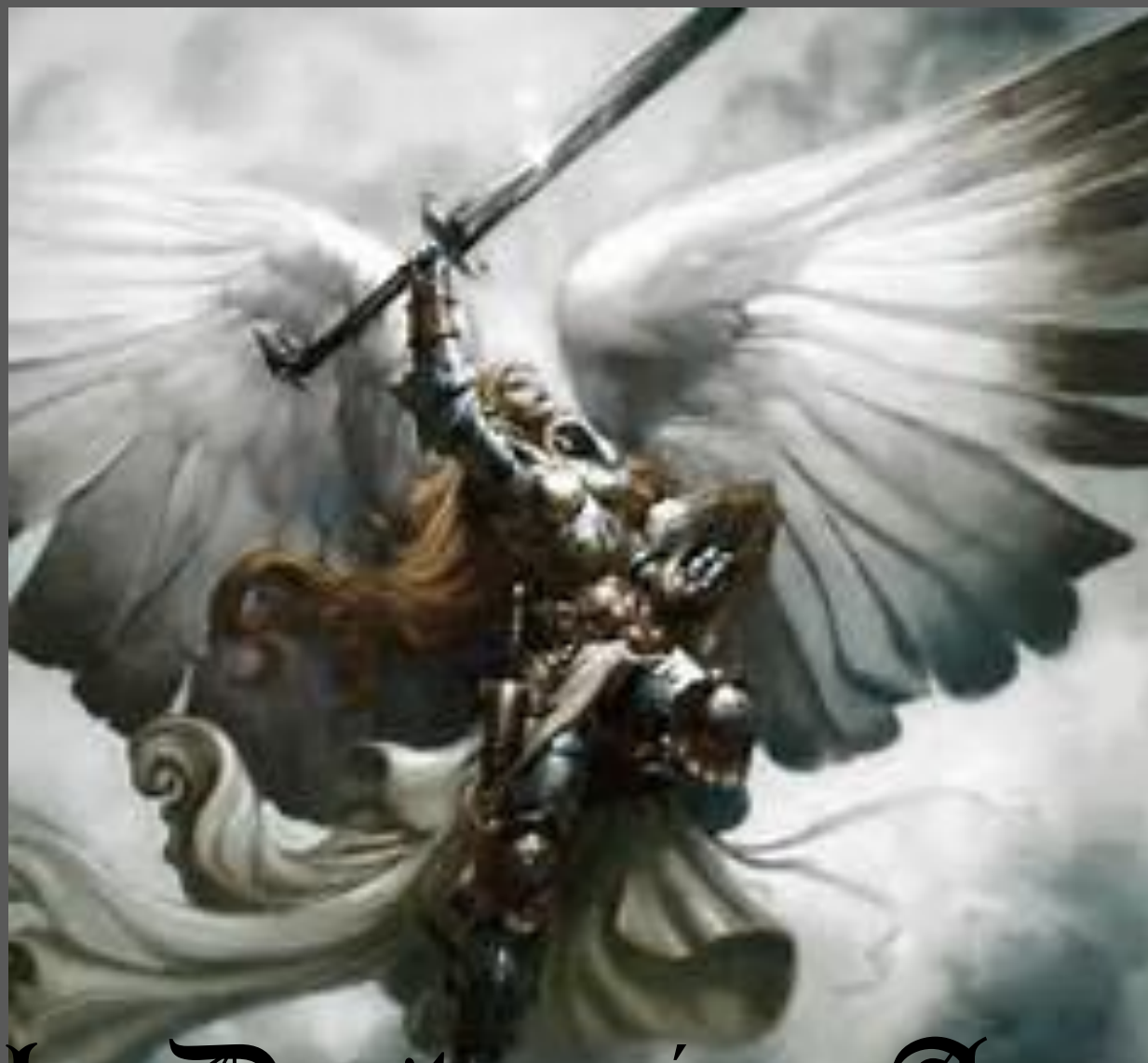
The Destroying Angel