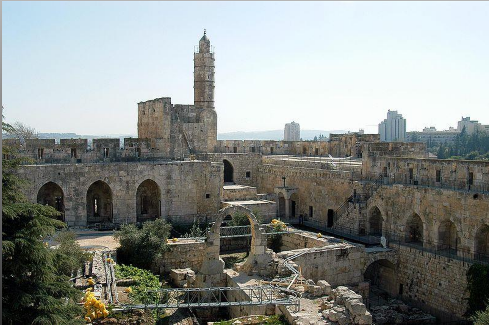
Citadel of David (tower of David)