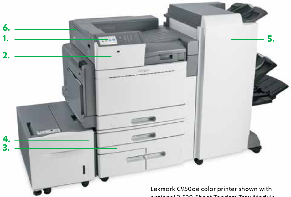
Lexmark C950de color printer shown with optional 2,520-Sheet Tandem Tray Module, Booklet Finisher and 2,000-Sheet High Capacity Feeder.

Reduce unnecessary printing and simplify work processes through solutions applications preloaded on your device. Choose additional Lexmark solutions to fit your unique workflow needs.