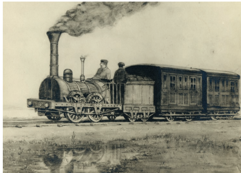
FIGURE 7.21 This engraving is based on an 1836 drawing by John Loye of the Champlain and St. Lawrence Railroad, the first public railway in Canada. Analyze: What are some advantages of travelling by train versus travelling by horse or wagon?

"Canada is the land of hope. Here, everything is new; everything going forward; it is scarcely possible for arts, sciences, agriculture, manufactures, to retrograde [move backward]; they must keep advancing." — Catharine Parr Traill, backwoods settler