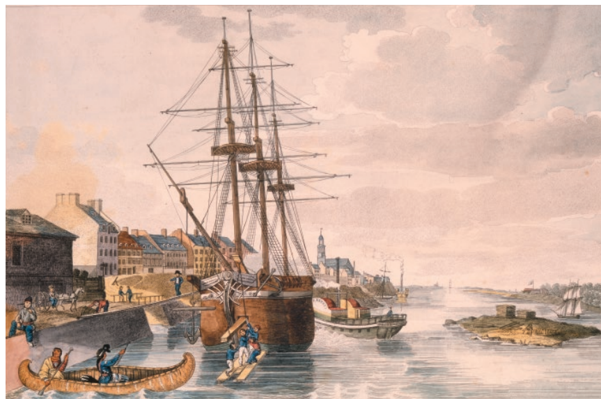
Industrial Revolution the rapid transition to new manufacturing processes in the 1700s and 1800s

Crossing the Atlantic Ocean by ship was the only way to travel from Britain to Canada. Many travelled by timber ship. Timber ships were built to carry lumber. But during the immigration boom, these ships were often used to carry immigrants from Britain to Canada. Immigrants would live for weeks in parts of the ship that were designed to hold timber, not people. The ships would then be loaded with timber and head back to Europe. Look at the painting in Figure 7.10 . It shows the Montréal harbour in 1830 and the loading of a timber ship. How do you think immigrants felt knowing they were boarding a large ship that was not built for passengers?