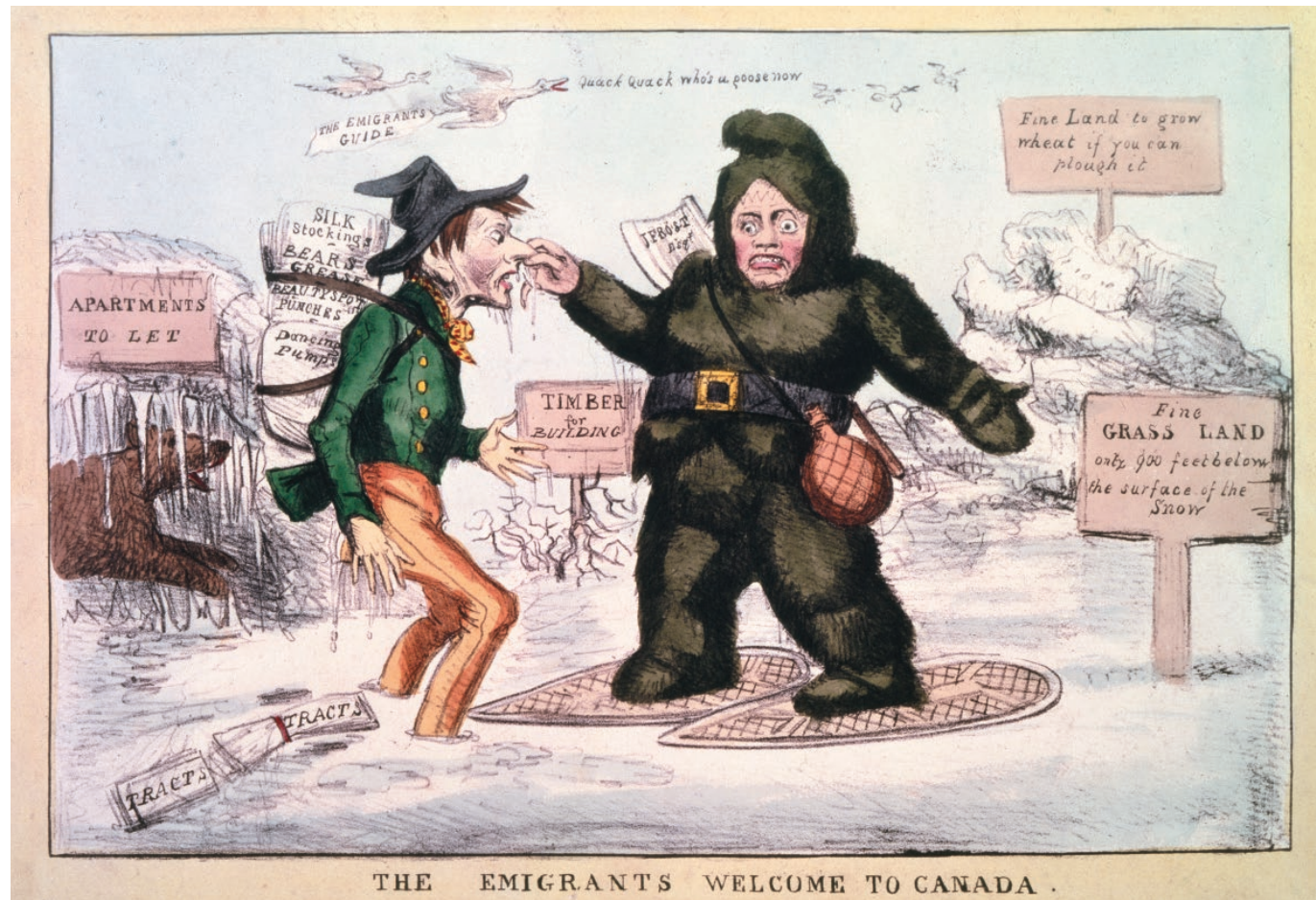
FIGURE 7.16 The Emigrants' Welcome to Canada, 1820 shows an immigrant arriving, unprepared for life in Canada. Analyze: What is the artist's view of immigrants who are coming to settle in Canada?

The increase in population meant that more people were clearing new land. However, settlers and immigrants were not always prepared for life in Canada. As you learned in Chapter 5, rural life in the backwoods of Canada meant long days of hard labour. There was little time for socializing, and homes were often separated by several kilometres of forest. For weeks at a time, settlers might see no one except their immediate family. Examine the cartoon in Figure 7.16 . How was the experience of these immigrants living in Canada the same as or different from your own?