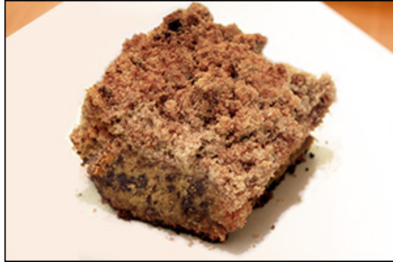
Chocolate Chip Coffee Cake, Average