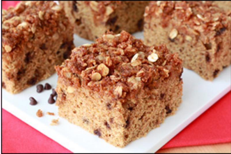
HG's Choco-Chip Coffee Cake