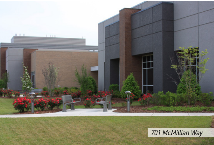
701 McMillian Way