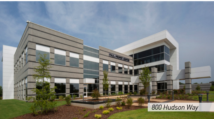
800 Hudson Way