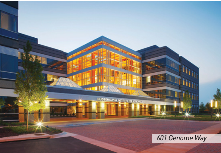
601 Genome Way