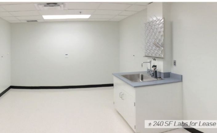
± 240 SF Labs for Lease