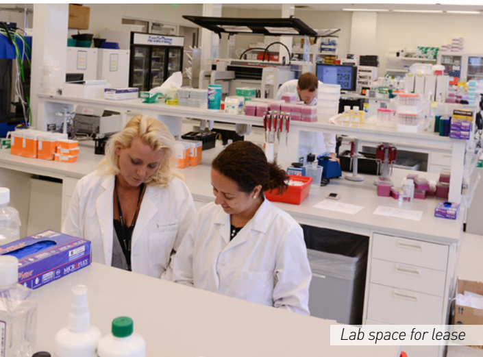
Lab space for lease