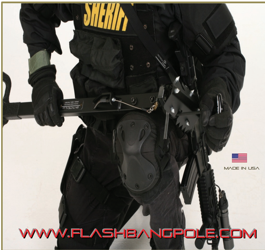
Circle 39 on Reader Service Card

32 Ron Chepesiuk. "Global Terrorism-The Latin American connection persists." New Criminologist , November 1, 2008. Available at: http://www.newcriminologist.com/article.asp?mid=2103 . Accessed November 2, 2008.33