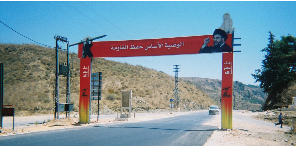
A picture of a Hezbollah sign over the highway in South Lebanon.

former prime minister widely believed to have legitimately won the June election. 13 The violence against protesters was particularly noticeable because it occurred on the holy day of Ashura, a day of mourning for the Shi'a martyr Hosein, the Prophet Muhammad's grandson.