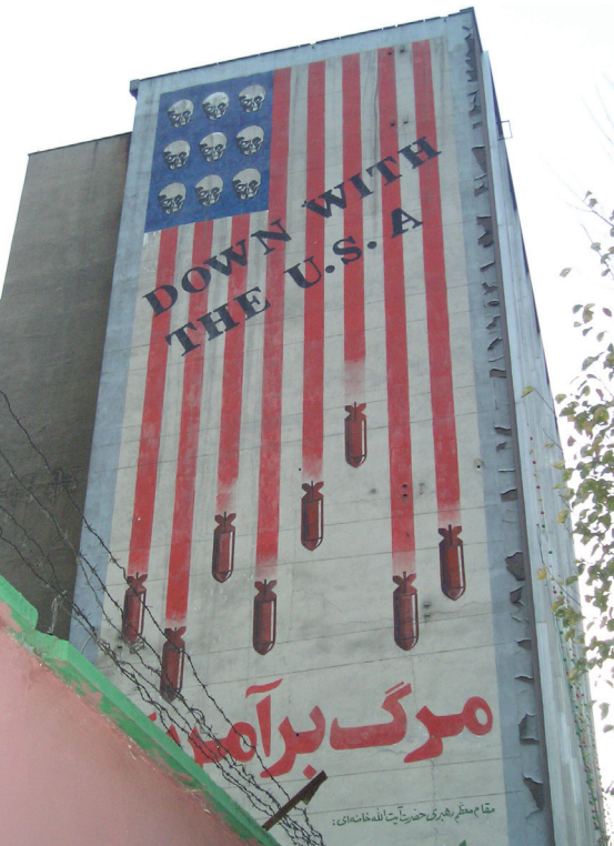
Anti-US mural, Tehran, Iran, 2004.

Al-Quds forces are believed to support anti-U.S. militia in Iraq such as the Mahdi Army of the anti-U.S. cleric, Muqtada al-Sadr, and elements of the Badr Brigade, which is linked to the Supreme Council for the Islamic Revolution in Iraq, a Shi'a political party. In addition to firearms, al-Quds operatives were allegedly supplying radical Shi'a groups advanced improvised explosive devices such as explosively formed projectiles and possibly more than 100 Austrian Steyr HS50 .50 caliber sniper rifles. 22