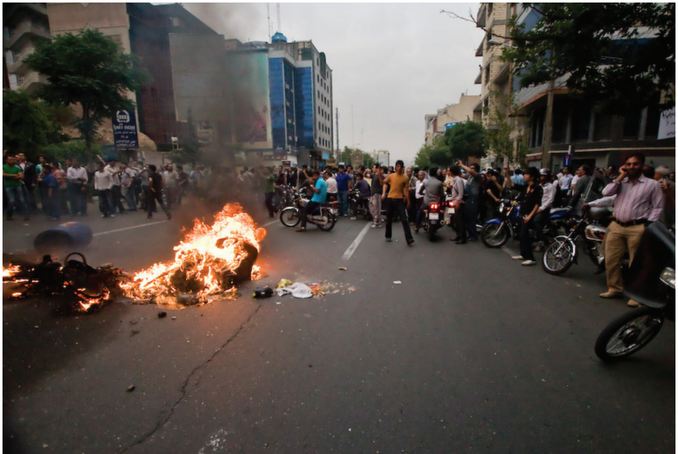
Protesters in Tehran, 2009.

reelection. Not since the 1979 revolution have so many Iranian citizens become involved in protesting the results of an election whose results were regarded to be highly questionable. On multiple occasions since the election, Iranian students and ordinary citizens have taken to the streets to protest the election's results. The government's crackdown on the protesters began quickly after protests started and one of the first casualties was 26-year-old Neda Agha-Soltan, whose death by gunshot was documented quickly on the Internet. 11 Iranian government sources were quick to claim Western influence over the protests and accused the CIA or British intelligence for Agha-Soltan's death or stated that her death was initially faked and she was shot on the way to the hospital. 12 Protests in December 2009 resulted in additional deaths, including a nephew of Mir Hosein Mousavi, the