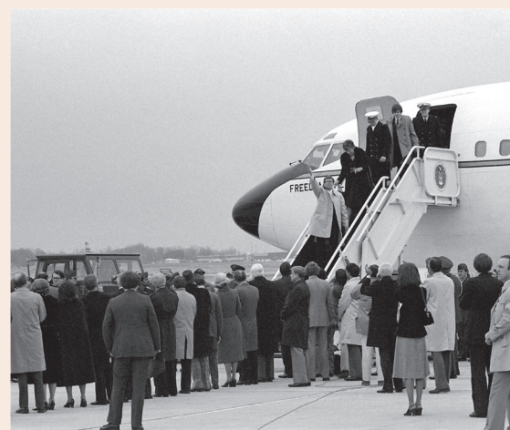
Recently freed Americans held hostage in Iran disembark Freedom One, January 27, 1981.

Fast forward to 2010 and the political situation is entirely different.