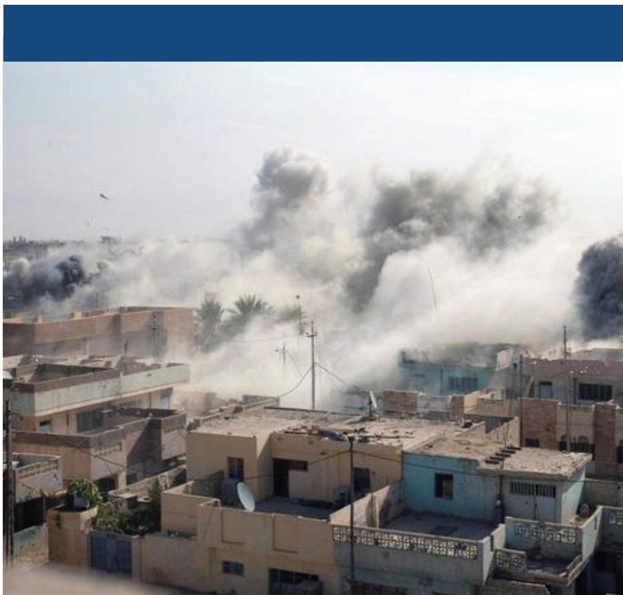
An insurgent stronghold goes up in smoke after an air strike in Fallujah, Al Anbar Province, Iraq, Photo: CPL Joel A. Chaverri, USMC

Use code: ssi_sirt10 for SSI discount price.