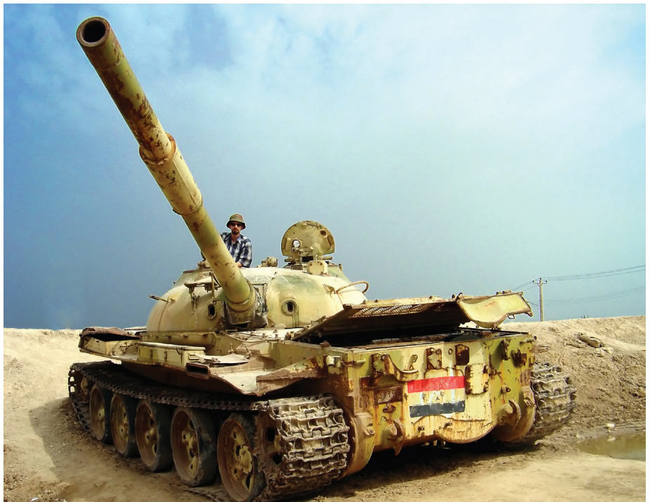
Iranian posing on an Iraqi T-62 tank in Khorramshahr, Khuzestan in Iran, just across the border from Iraq.

By early 2008 there were signs that al-Qaeda was withering following a mass