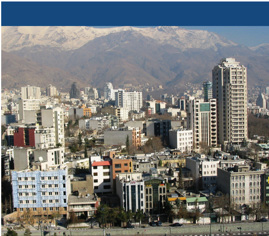
Northern Tehran City, Iran with Alborz Mountains in the background.

Force could have made all the difference, but Iran was pragmatic because such an act could have brought swift retribution from Washington.