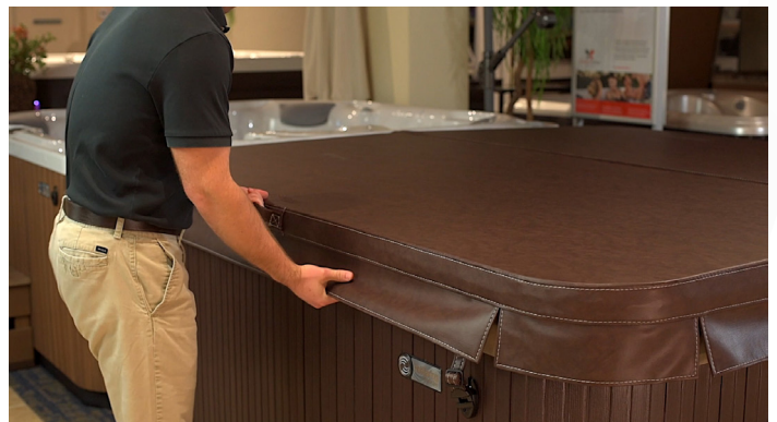
6. When you are finished using the hot tub, remove the pin, disengage the cover, close and lock.

Be sure to contact your local Hot Spring dealer to order your replacement cover when you see signs of wear on your spa cover.