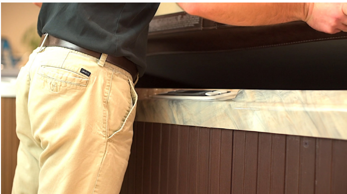
3. Push the cover back until it stops.