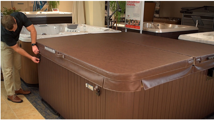
1. Unlock the spa straps.