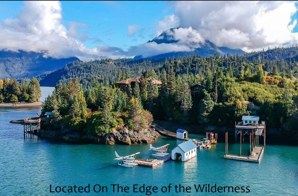
Located On The Edge of the Wilderness

If you are searching for the raw and unspoiled theater of the wild yet still long for the luxuries of civilization, Stillpoint Lodge is the place for you.