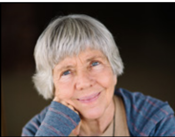
Mary Pipher Clinical Psychologist & Writer Families in Nature July 26-29

Possible long-term solutions include the bridge concept to retain a "mainline route" with the road in its current location, a "north route" constructing five miles of new bypass road over the hills to the north, or a "south route" constructing five miles of new bypass road across the flats and braided rivers to the south. The "mainline route," already recommended by FHWA, will be identified by NPS as the preferred alternative in a forthcoming planning document. We are heartened by the planning efforts underway.