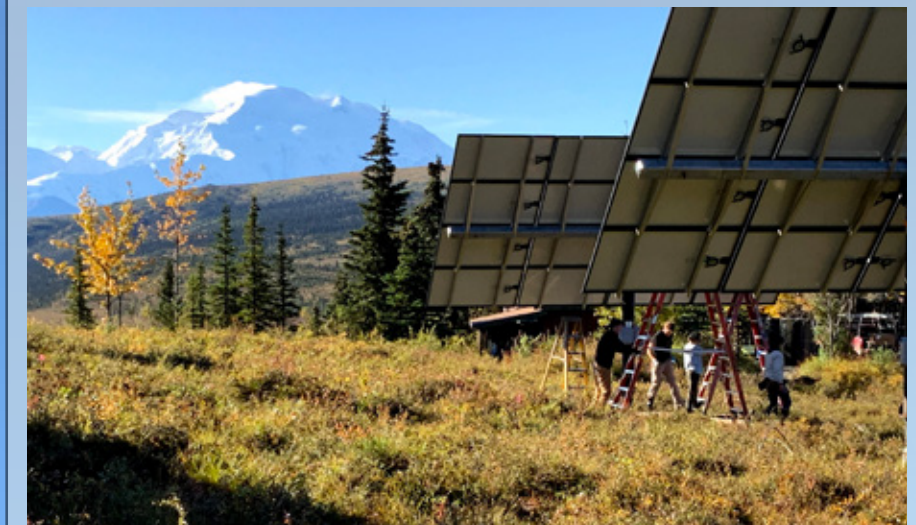
The Alaska Range proved to be a great aid in orienting solar panels: Mt. Koven, at 12,142 feet and situated due south, is about as conspicuous and permanent of a landmark as we could ask for!