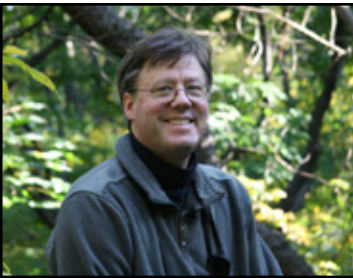
David Sibley Ornithologist, Author, & Illustrator Bird Identification & the Art of Observation June 4-6 | June 7-10