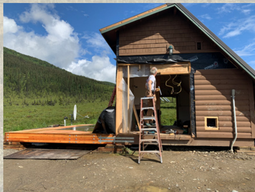
Our existing power building was doubled in size, extensively remodeled, and all its equipment swapped for new, all while continuously powering Camp Denali – a bit like overhauling an airplane engine as the plane is flying!