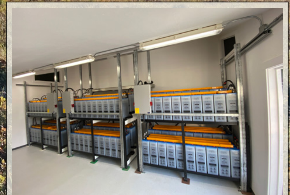
18,000 lbs of Nickle-Iron batteries provide storage capacity in the new system. A proven technology, they promise decades of service, and should withstand the depths of winter, unattended.