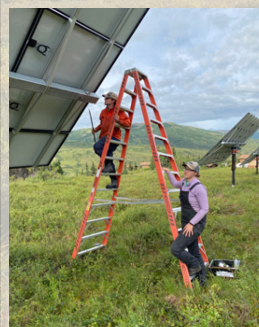
18 arrays, comprised of 16 panels each, works out to 288 total panels- and a staggering number of hardware fasteners to install and tighten.