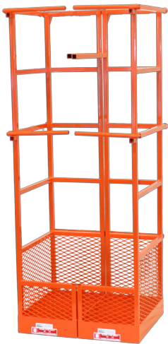
Systems Scaffold Carrier "XL" 28" x 22.5" x 72" H (Fully Assembled)