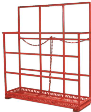
Frame Scaffold Carrier 66" x 20" x 74"H