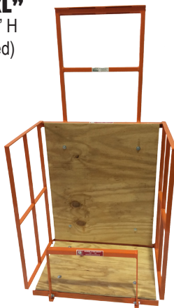
Universal Platform 32" x 24" x 64.25H