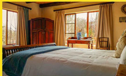
Room One - Queen size bed, bathroom with a bath, toilet and basin