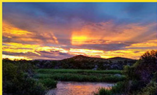
Daily Rate: Double Rate - R700 Single Rate - R500