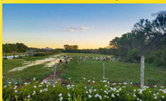
Daily Rate: Double Rate - R600 Single Rate - R500

These two rooms are situated at the main house with private access from the river camp. Room 1 overlooks the river while Room 2 overlooks the pastures.