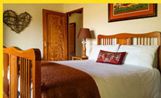
Room Two - Double bed, bathroom with shower, toilet and basin