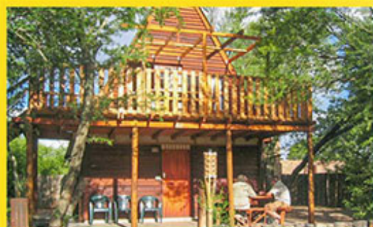
SUNSET CABIN - Top floor of wooden cabin. Double bed and 2 mattresses in loft. En-suite bathroom with toilet.