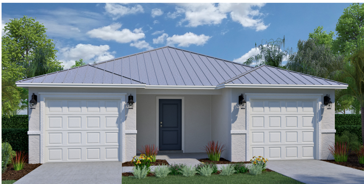
Architectural Style A