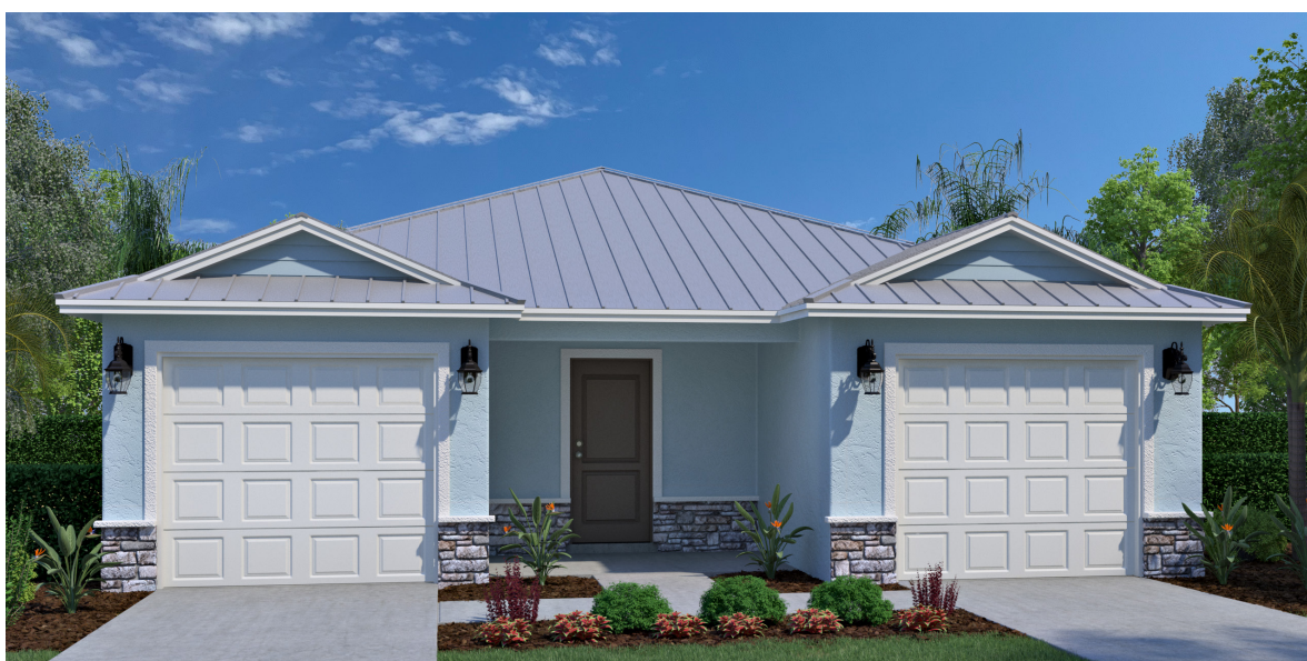
Architectural Style B