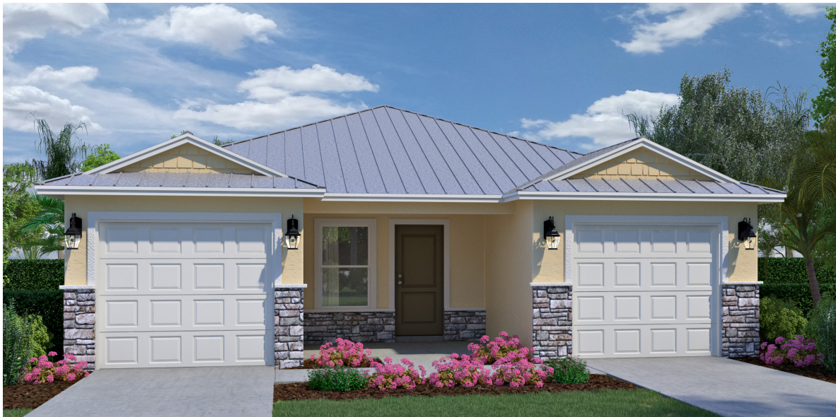
Architectural Style B