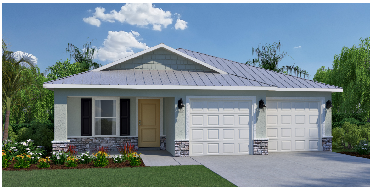
Architectural Style B