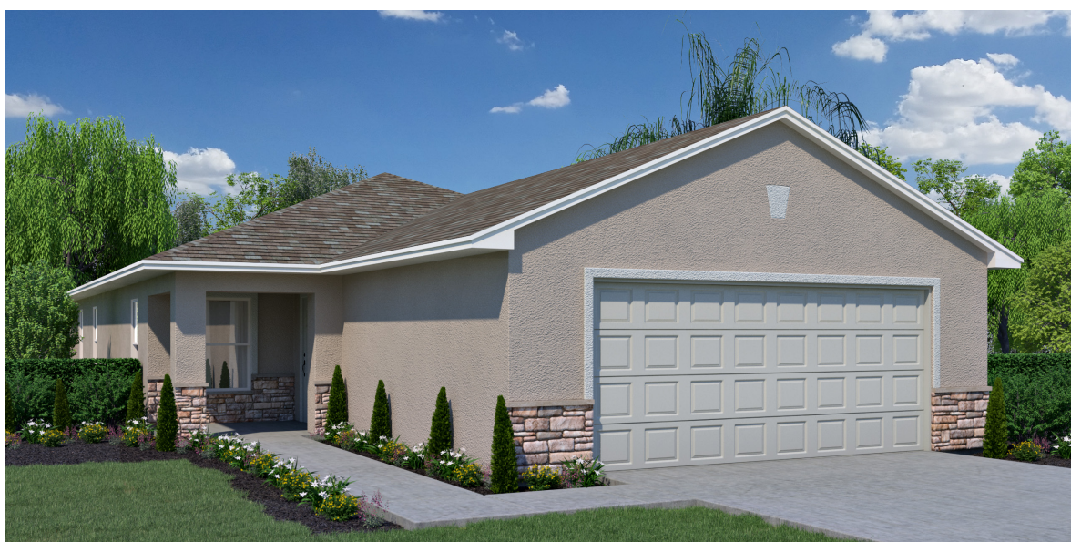
Architectural Style B