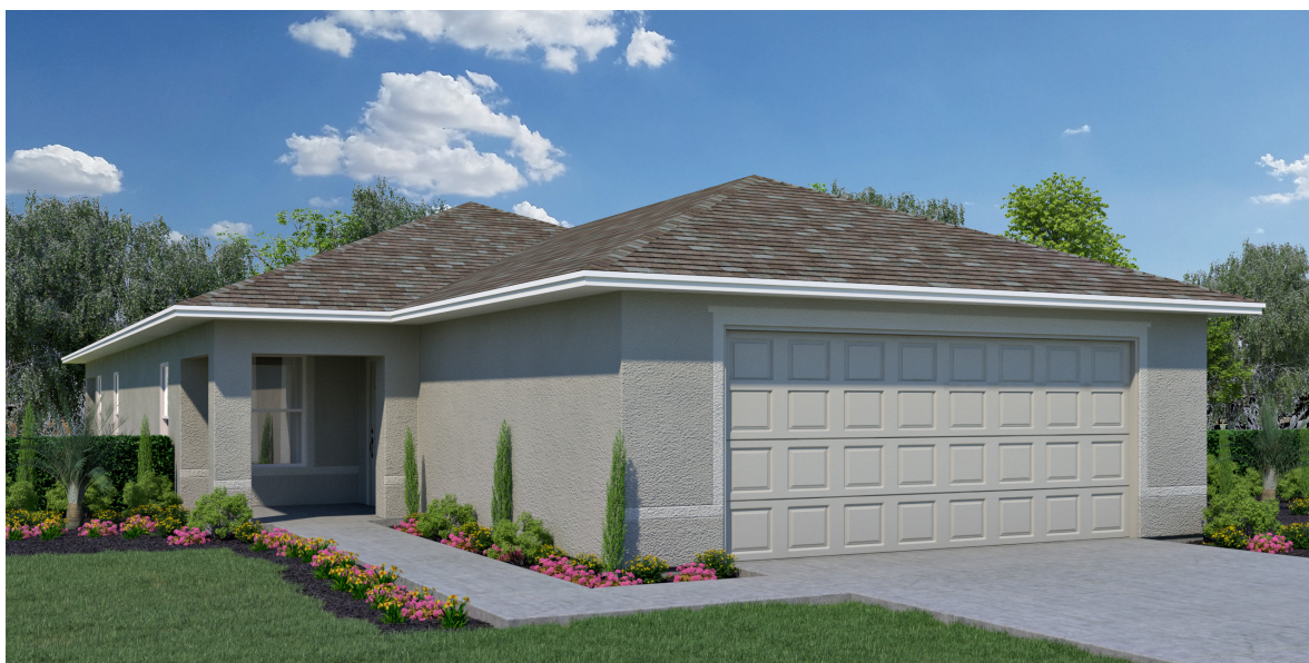
Architectural Style A