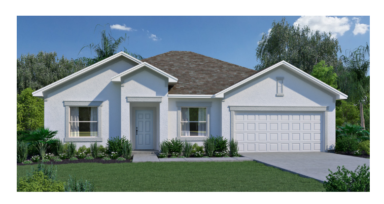
Architectural Style B