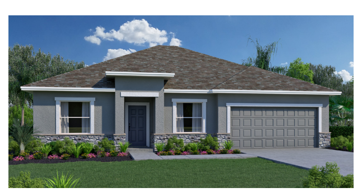
Architectural Style A - Stone