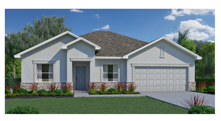
Architectural Style B - Stone