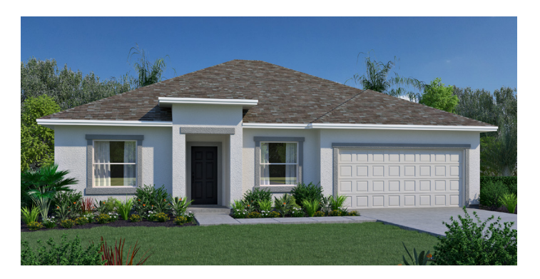
Architectural Style A