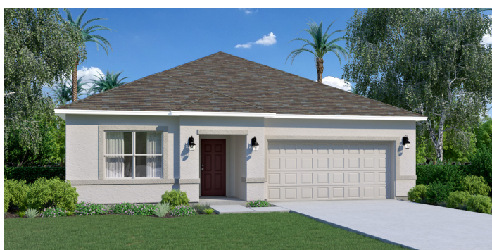
Architectural Style A