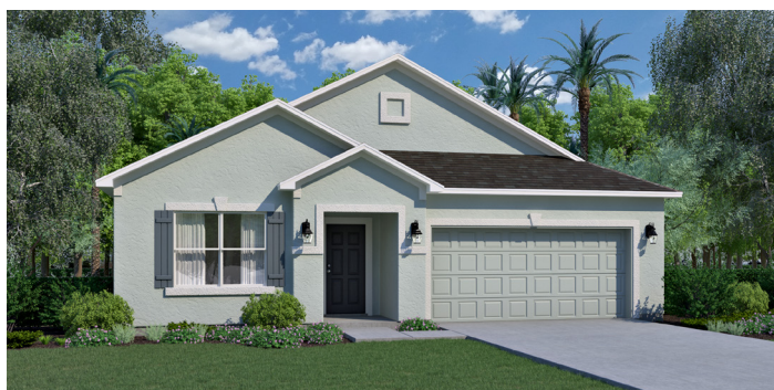
Architectural Style B