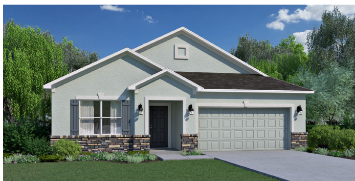
Architectural Style B - Stone