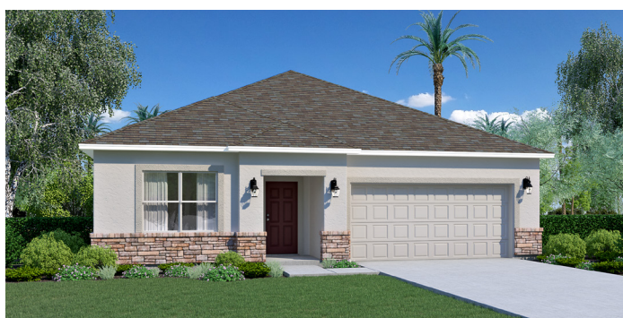
Architectural Style A - Stone