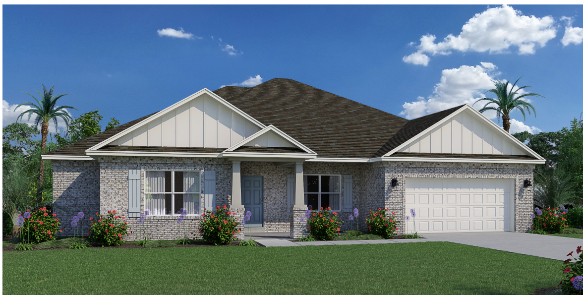
Architectural Style B