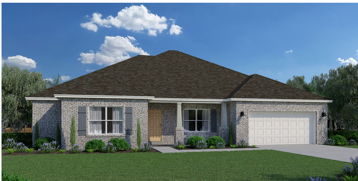
Architectural Style A