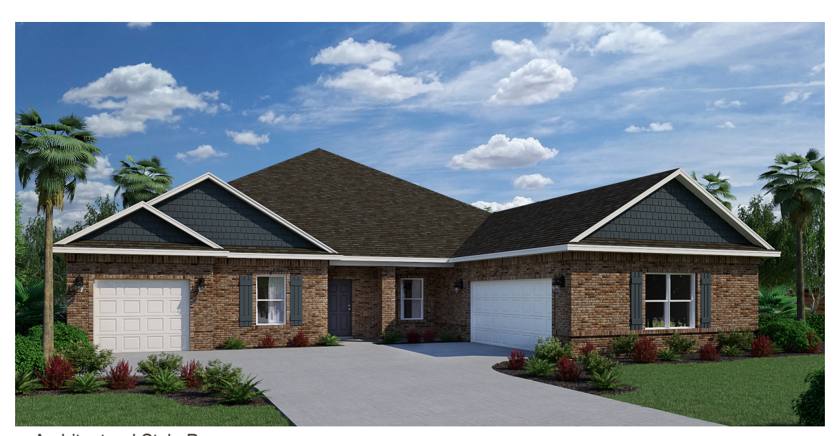
Architectural Style B