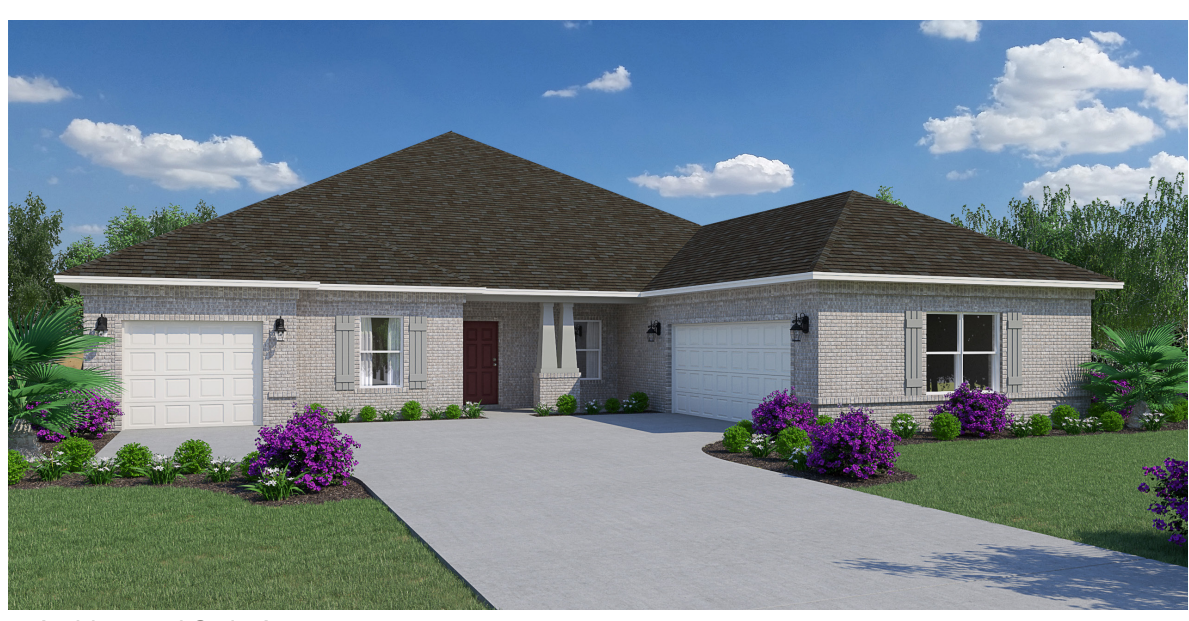
Architectural Style A