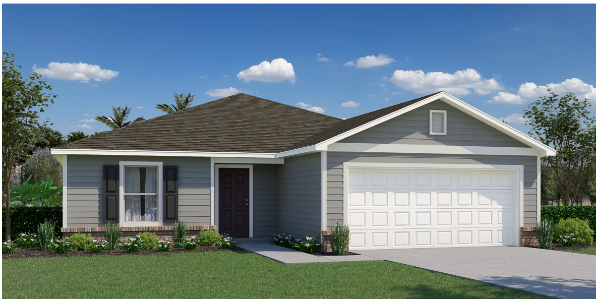
Architectural Style B