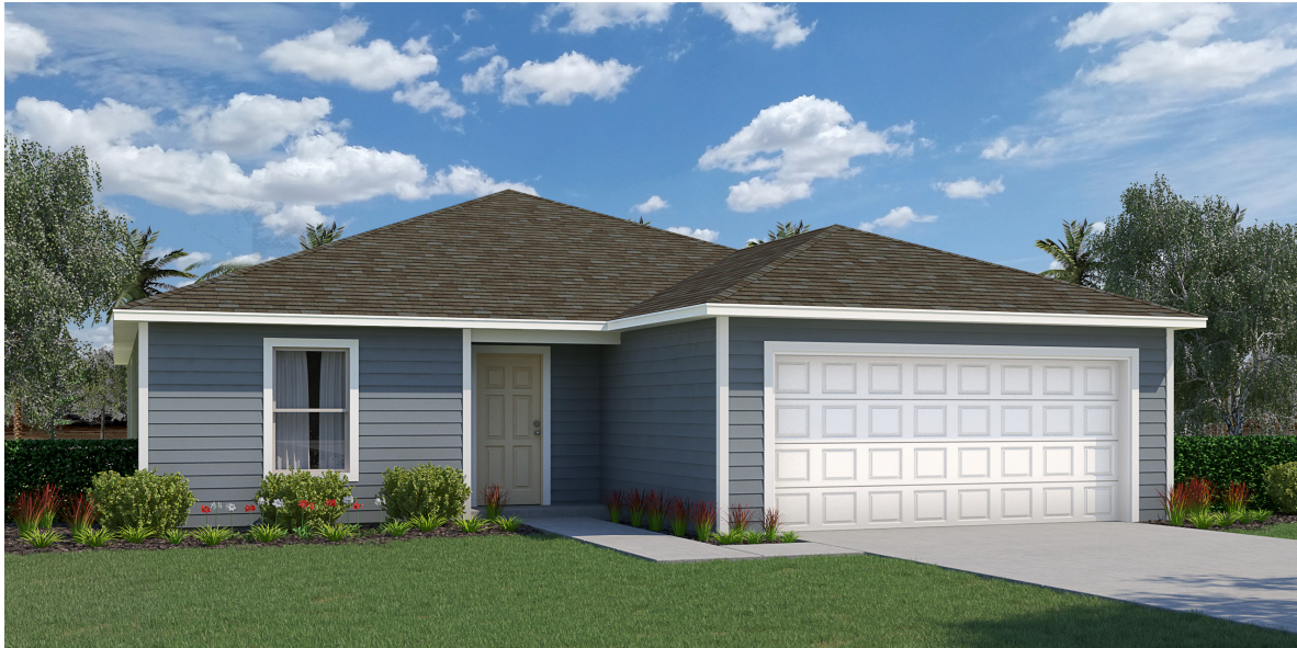
Architectural Style A