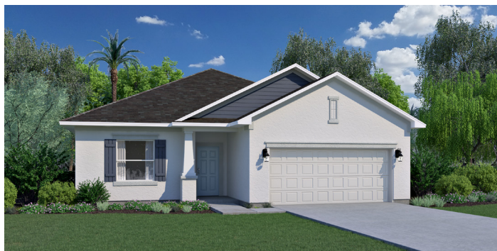
Architectural Style B