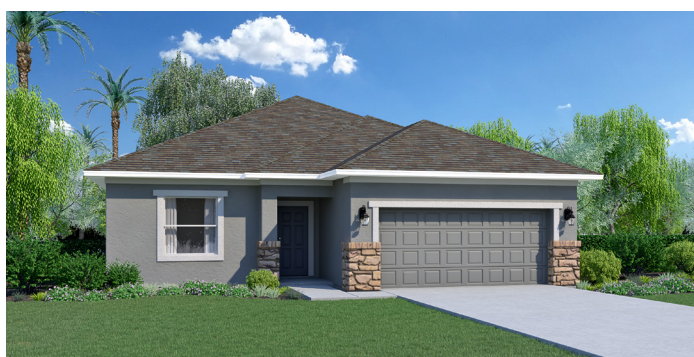
Architectural Style A - Stone