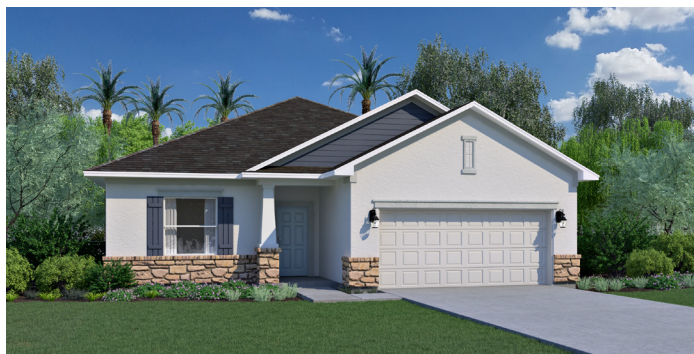
Architectural Style B - Stone