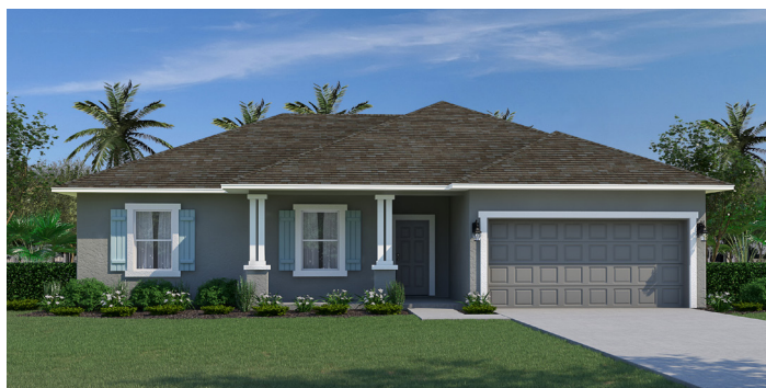
Architectural Style A