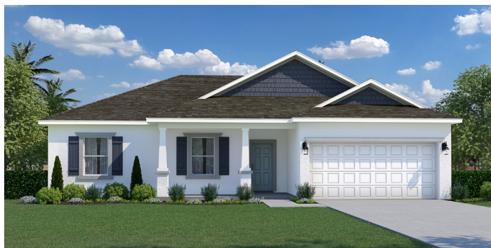
Architectural Style B