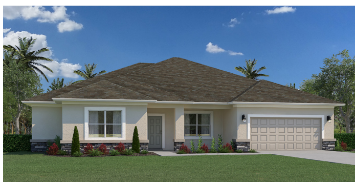
Architectural Style A - Stone