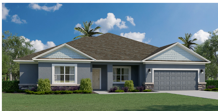
Architectural Style B - Stone