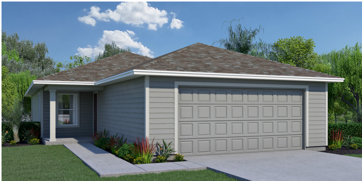
Architectural Style A