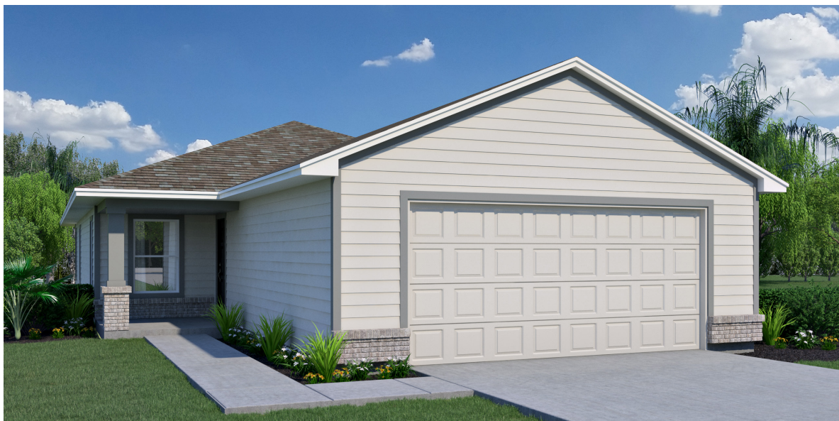
Architectural Style B