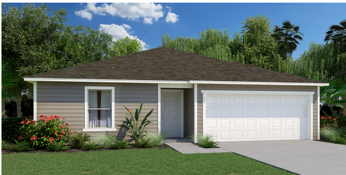
Architectural Style A