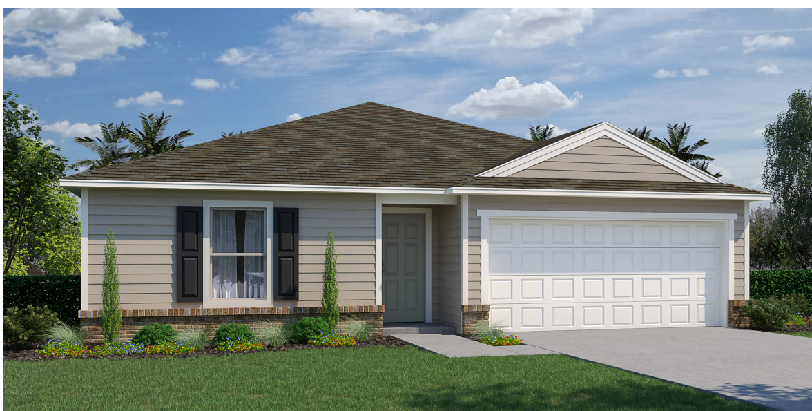
Architectural Style B