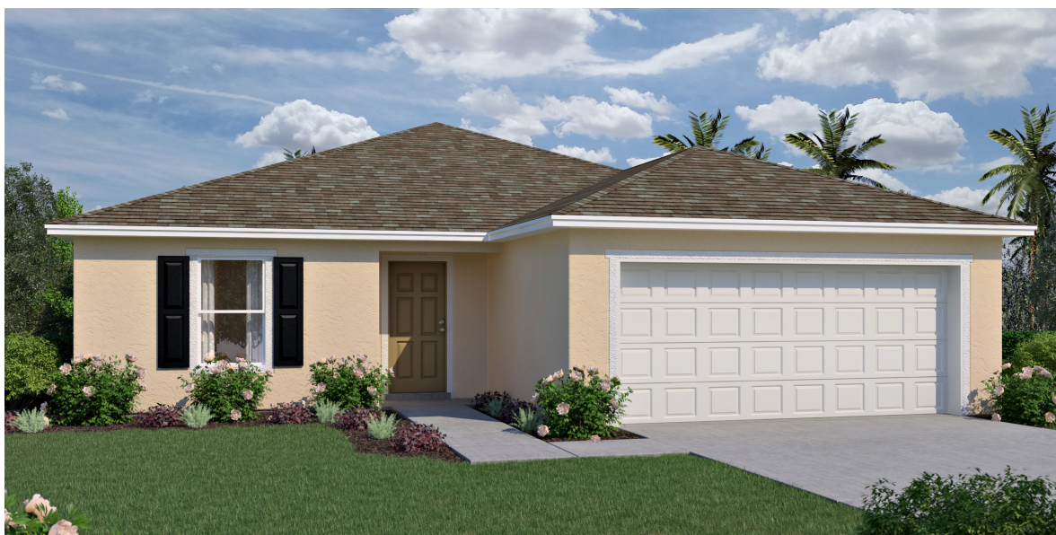
Architectural Style A