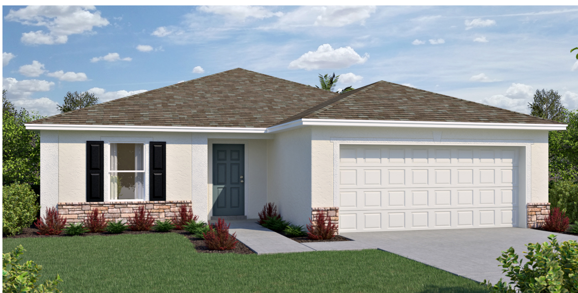
Architectural Style B