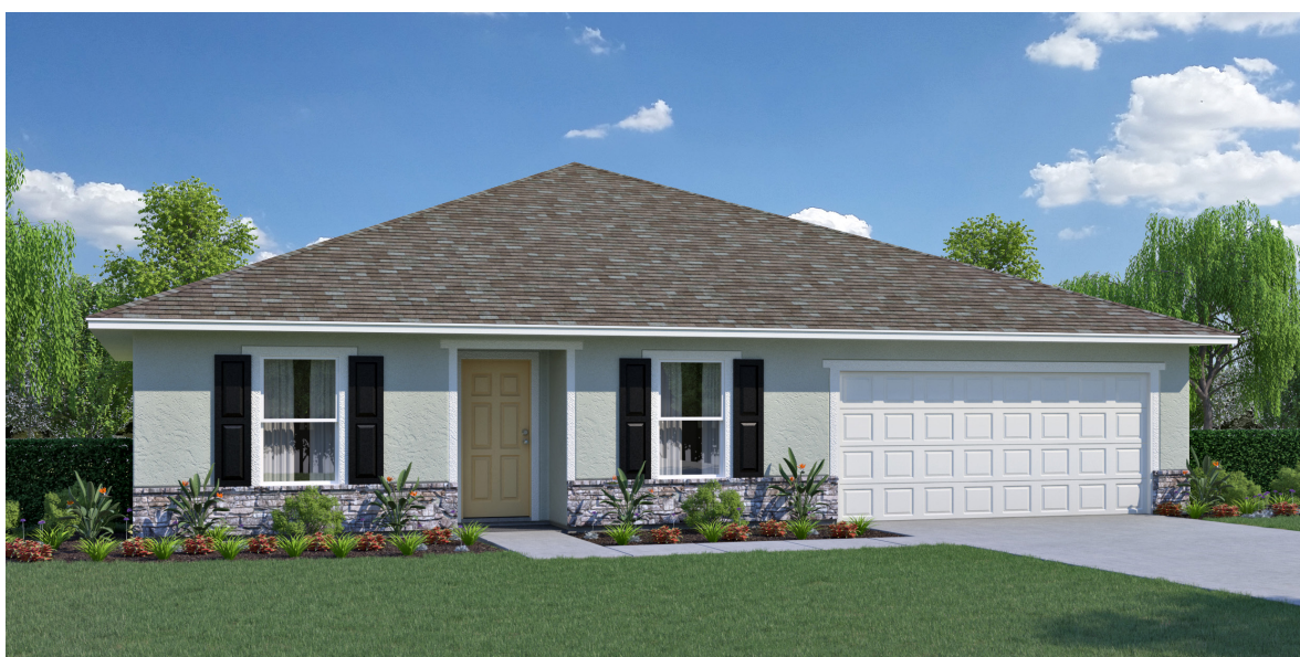
Architectural Style B