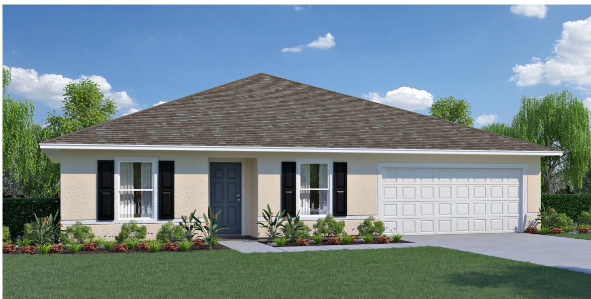
Architectural Style A