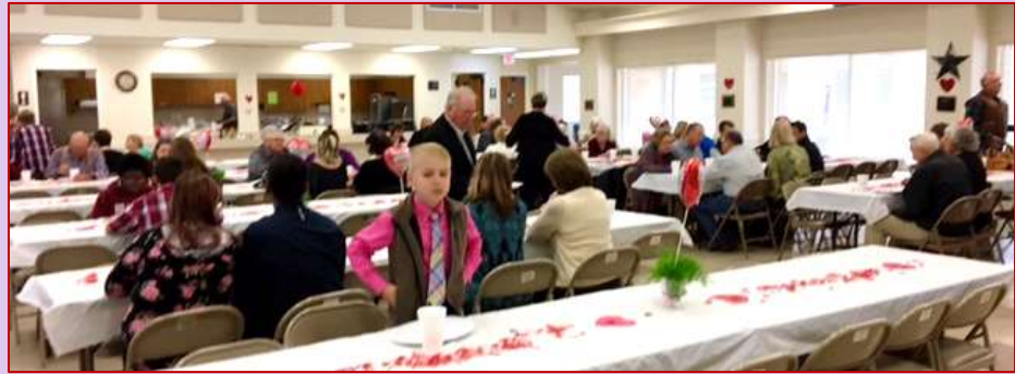
Valentine's Day Celebration & Congregation Appreciation Lunch

Our new Confirmation class will begin on Sunday, March 18, 2018. The group will meet for 2 hours on Sundays right after church. In our classes we will learn about God, grace, Jesus, Sin-Atonement-Reconciliation, the Holy Spirit, prayer, the Bible, Christian decision making, the sacraments, worship, Methodist beliefs, and mission and service. Confirmation Sunday is planned for May 20. Blessings to all who will be part of this class.