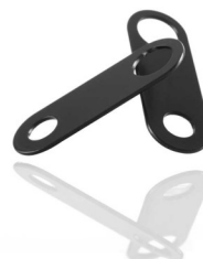
Rear Turn Signal Relocation Bracket