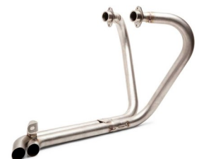
Slash Cut TT Exhaust