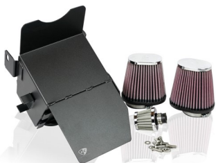
Airbox Removal Kit