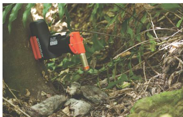
Goodnature A24 rat & stoat trap