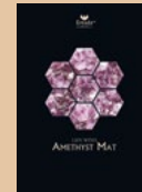
PRINTED OWNER'S GUIDE