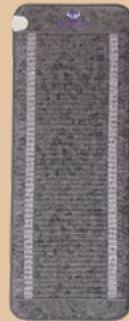
MIDSIZE (COMPACT PRO) MAT