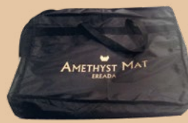
CARRY AND STORAGE BAG FOR YOUR MAT