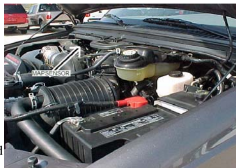
MAP SENSOR LOCATION FIG. 3