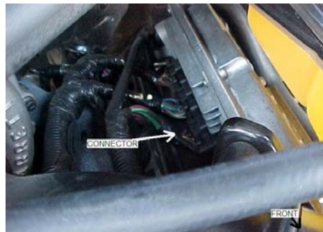
IDM PLUG LOCATION FIG. 2