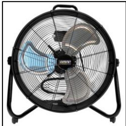
or Mount to Wall