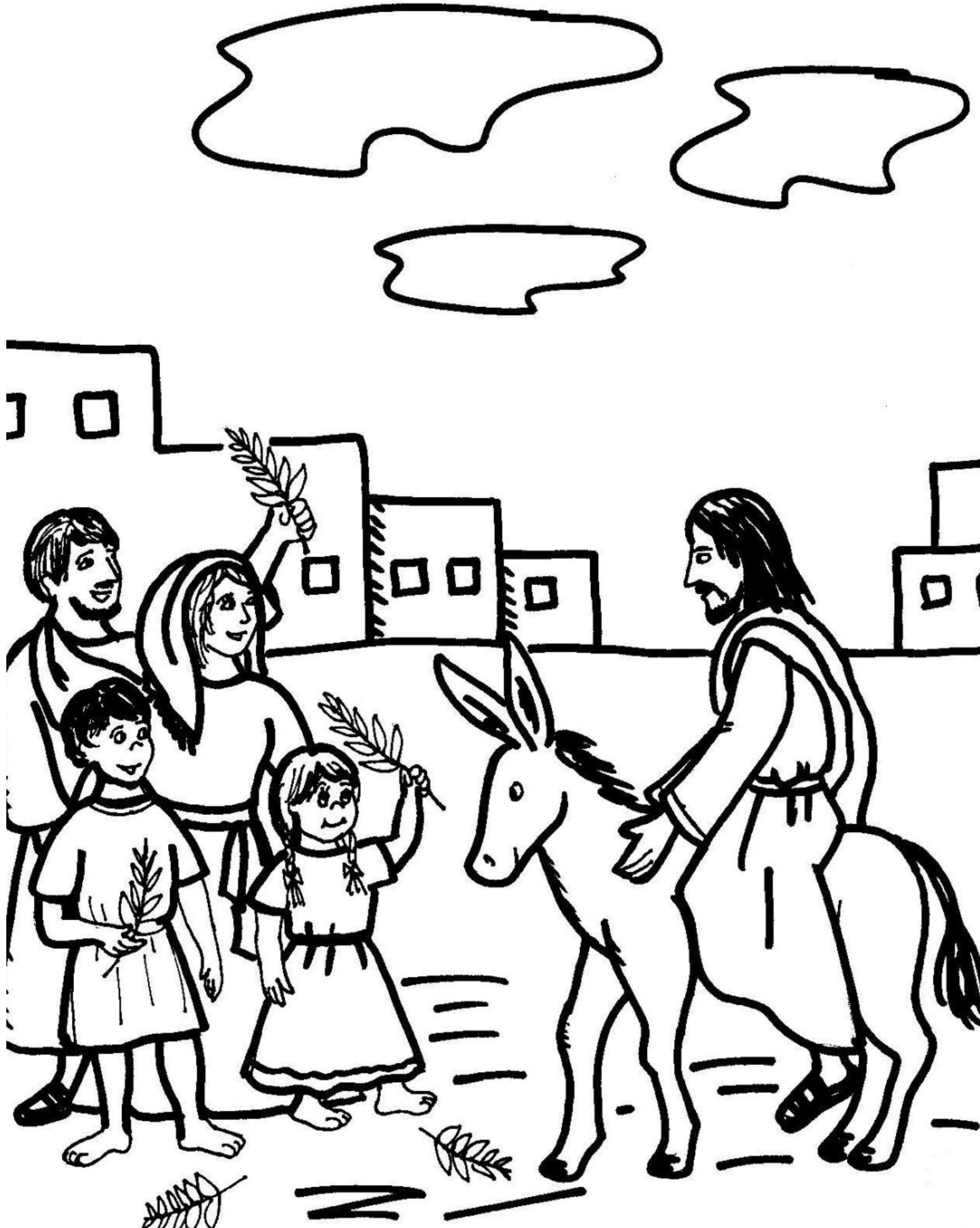
TRIUMPHAL ENTRY INTO JERUSALEM