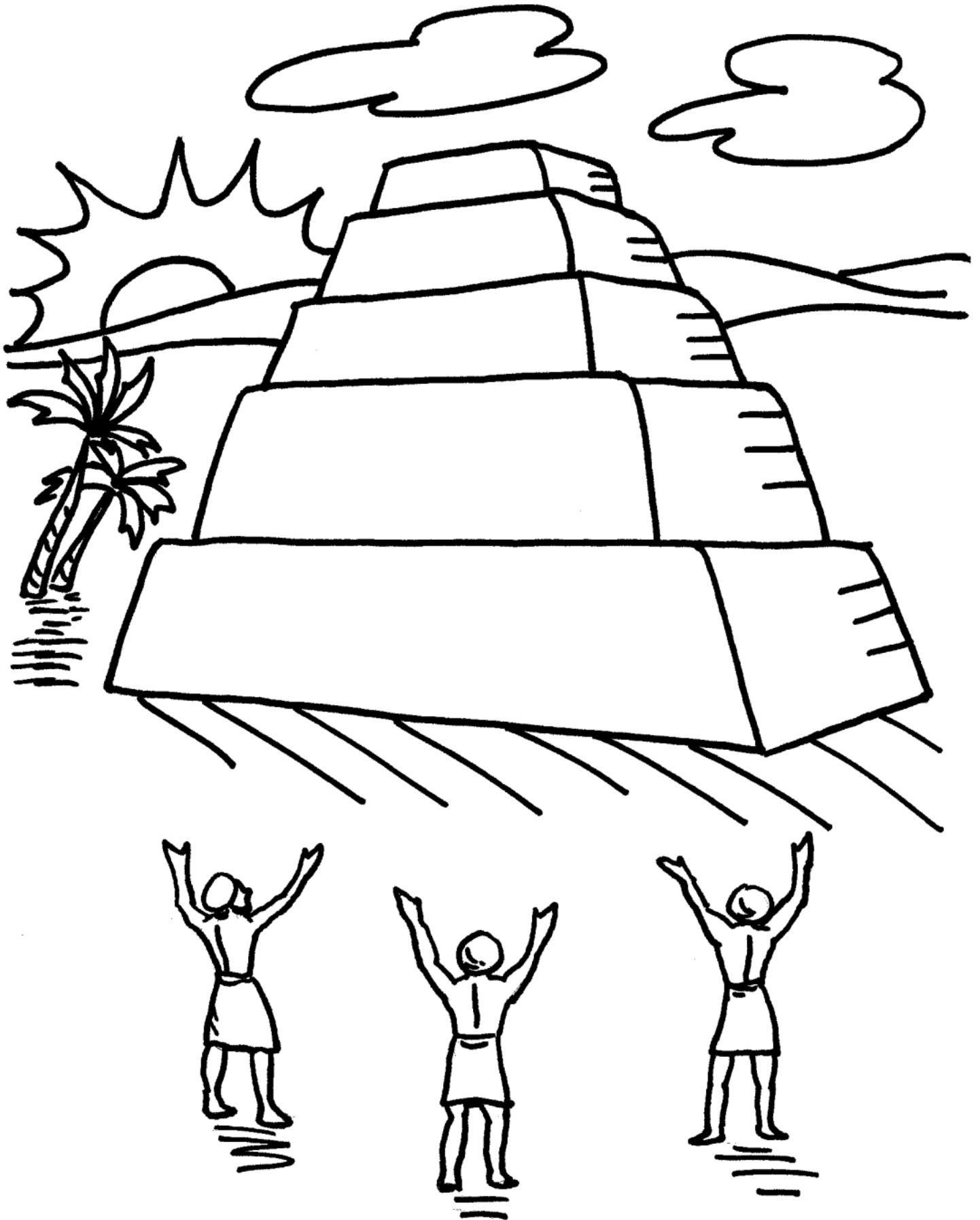
Tower of Babel